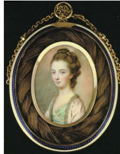
Figure 3. Portrait of a Lady , 1771. John Smart. Watercolor on card; h. 4.3 cm (1¾ in.). From Important Portrait Miniatures, Gold Boxes and Objects of Vertu (London: Christie's, 21 November 2000), lot 103. Current location unknown.