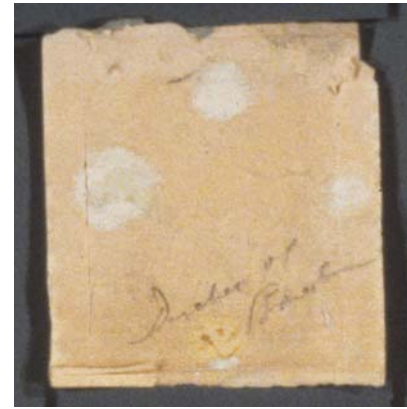
Figure 1. Conservation photograph showing the verso of the drawing before the backing was removed.

Compared to his contemporaries George Engleheart (1752–1829) and Andrew Plimer (1763–1837), whose female sitters were often painted in similar simple white gowns, Smart often lavished more attention on the costumes in his portraits of women, whose dresses incorporated colored silks, printed fabrics, and luxury trimmings like lace and fur, as seen here. The sitter's head and shoulders face right,